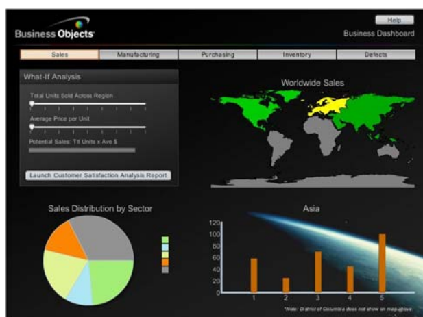
Figure 1: Gain Real-Time Insights to Business Data

Imagine a sales executive who illustrates sales information for different products across various markets and regions. The executive can now use Xcelsius what-if analysis to demonstrate how decreasing inventory for a particular product line might affect northeast regional sales. Because these visual models stay connected to data sources, the model is constantly refreshed, guaranteeing up-to-date insight for the executive.